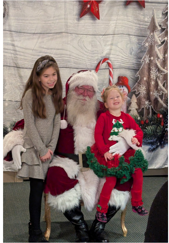
Christmas with Santa!