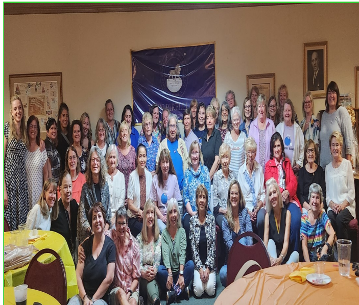
Women's Bocce Banquet