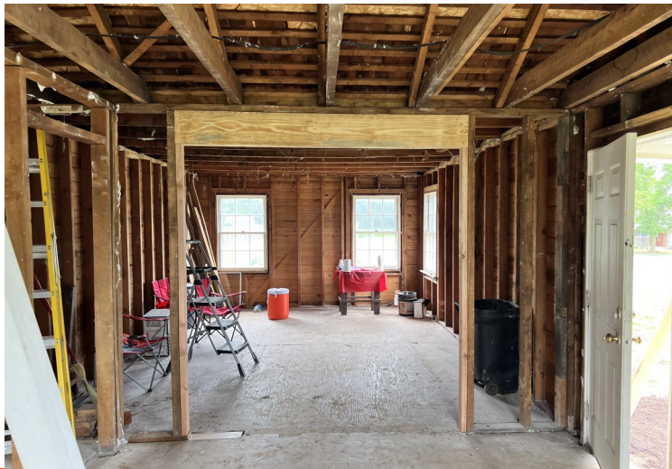
Little House Progress– Inside demo & new roof