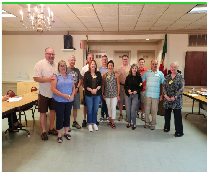
WELCOME NEW MEMBERS!