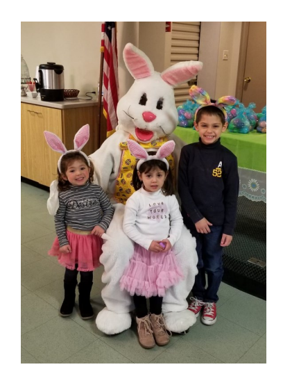
The Easter bunny was finally back to the Lodge!

Mark your calendar to help us make cookies for Festa!